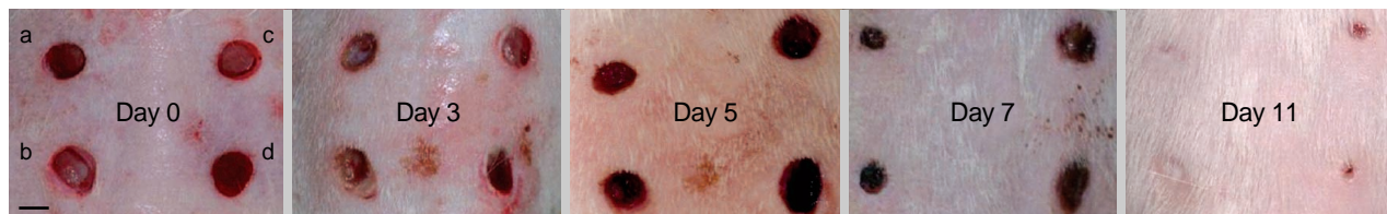
Fig. 1. The effects of ozonated olive oil on clinical wound closure. The photomicrographs demonstrate the enhanced wound closure, in the ozone group, on the left two wounds (a and b) on the back of the guinea pig, as compared to the oil group (c) as well as the control group (d). (Bar=5 mm).

As shown in Fig. 1, there was an enhanced wound closure in the ozone group of wounds, the left two of the four wounds, as compared to the oil group as well as the control group. On